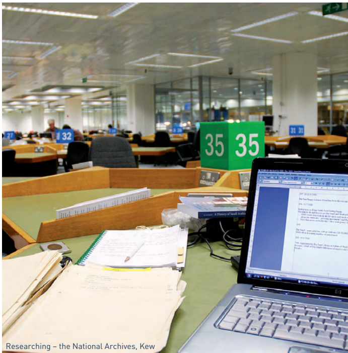
Researching – the National Archives, Kew