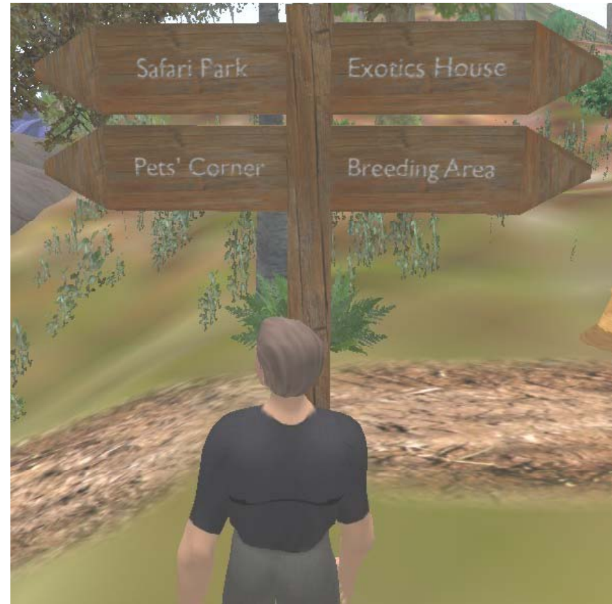
On Second Life: The Media Zoo